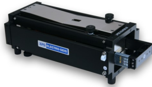
APS 113 horizontal