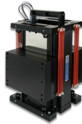
APS 400 vertikal with APS 0412 Reaction Mass